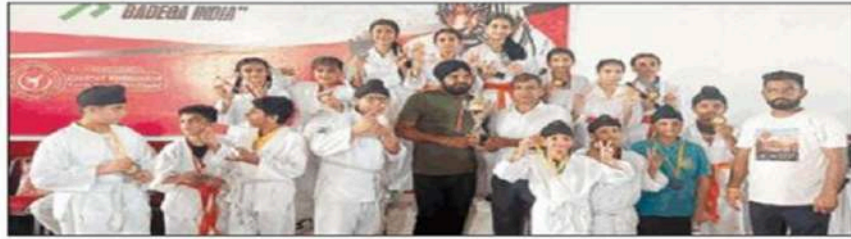
केंब्रिज स्कूल के विजेता विद्यार्थी।