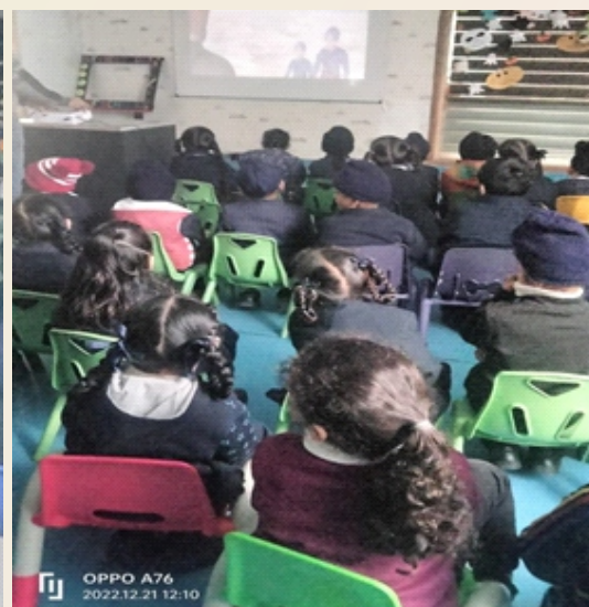
A movie about the four Sahibjadas depicting their Sacrifice was shown to the students.